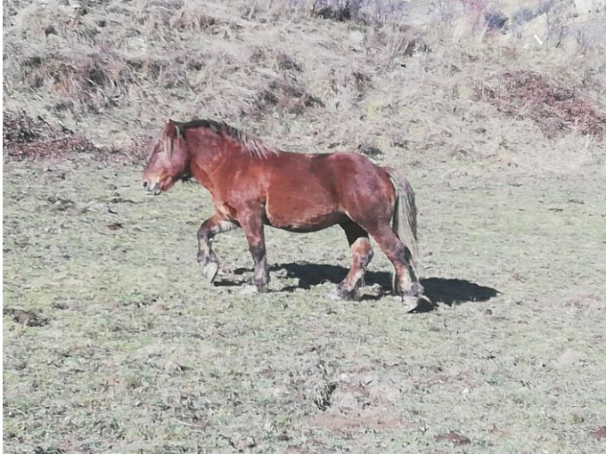
Figure 1. Cavall Pirinenc Català (stallion)

Although sidedness has been associated with lateralized grazing posture in warmblood horses 9 , CPC horses seems to be ambidextrous, with no effect of age and sex, so the use of right or left forelimb appears similar. This is probably due to a natural behaviour as the breed is scarcely human-managed.