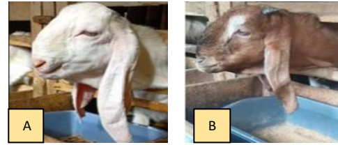
Figure 1. A: Senduro goat. B: Etawah crossbred goat.

Twelve local growing goats were used in this study